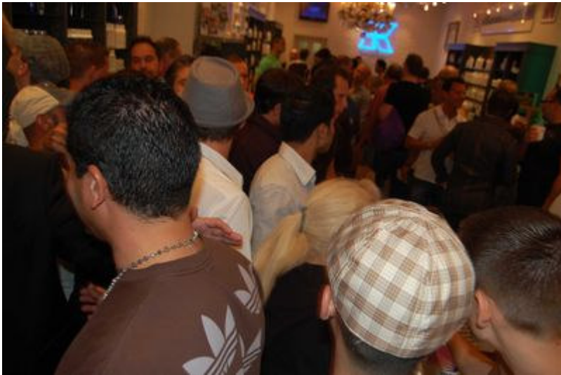
Kiehl's Since 1851.